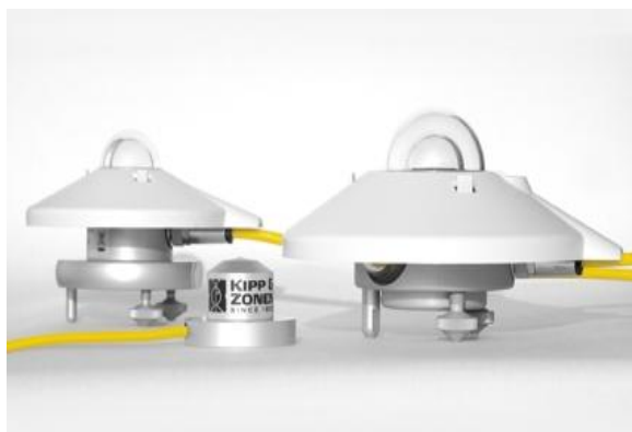
Fig.2 Pyranometer and Pyrheliometer

Solar radiation is the sunlight which is directly radiates its energy to the earth surface the solar radiation consist of ultraviolet rays, visible light and infrared rays. The three components of solar radiation are direct radiation, diffuse radiation and global solar radiation. The direct radiation is the radiation which is comes parallel to the earth without any noise and changes in radiation. The diffusion radiation is which the radiation is distorted by the atmosphere and clouds and the third one is the combined radiation of direct and diffused radiation in horizontal to the earth surface. The solar radiation measurement is most important to take decisions in field of renewable energy resources and also for research, determination of optimum location. The equipments used for solar radiation measurement is pyranometer and pyrheliometer.