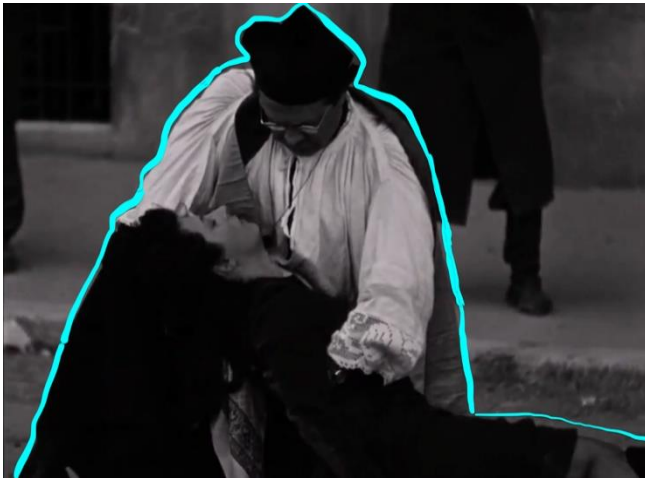
Fig. 3 Annotated still