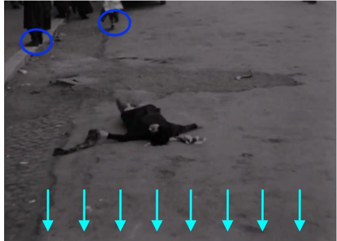
Fig. 2 Annotated still