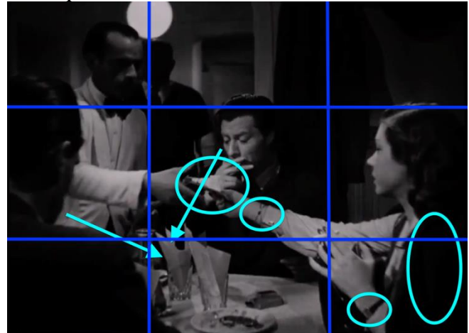
Fig. 5 Annotated still